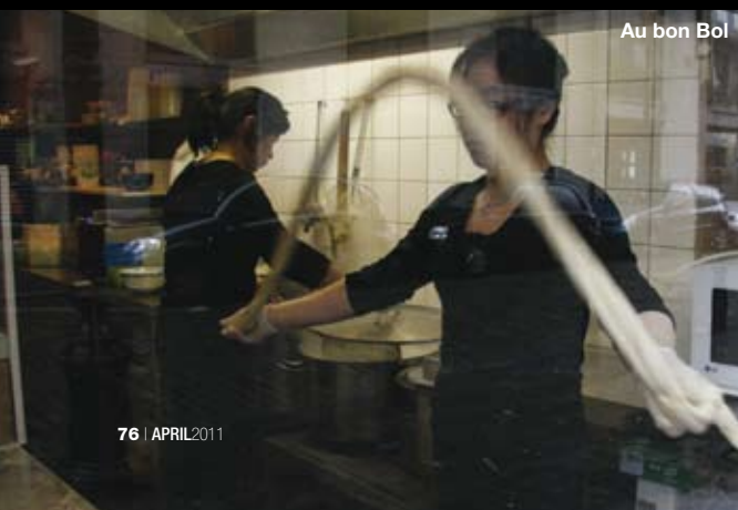
Au bon Bol

locale is a perfect stop-off as it is only 100 metres from Gare du Midi station. The décor hasn't changed here in decades, and while the bar is crowded with Spanish speakers, everyone is made to feel extremely welcome. From the tempting list of 35 tapas, don't miss the grilled sardines, octopus a la Gallega and piquant picadillos – chorizo fried with pimenton .