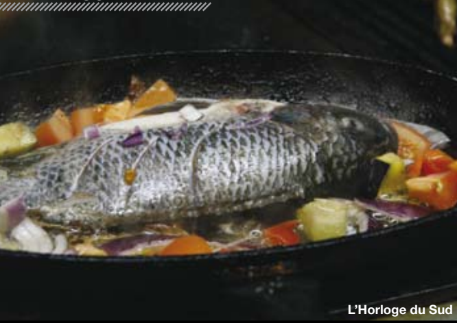
L'Horloge du Sud